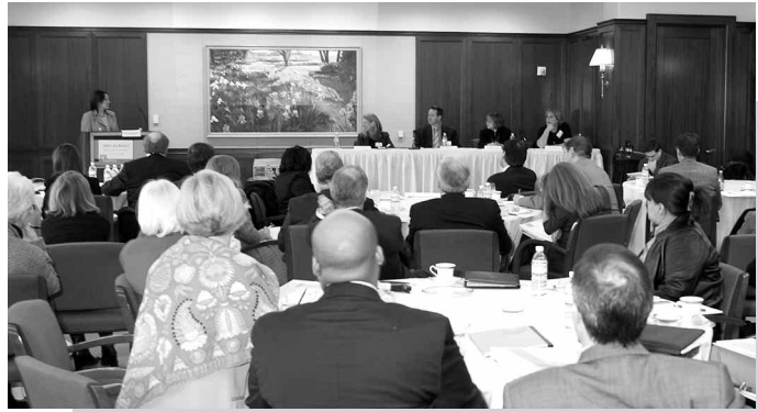
Summit panel and audience